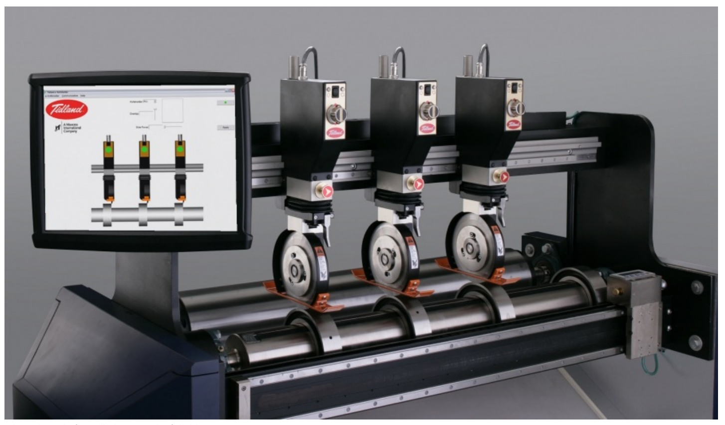
The industry's first all-electronic knifeholder

Reduced setup times, improved overall safety and greater predictability across the entire web are just a few of the benefits you can look forward to with Tidland's e-Knifeholder. The industry's first all-electronic knifeholder provides full control over blade overlap and side-force. More precise settings mean less blade wear and less downtime. Additionally, the easy-to-use electronic operation eliminates dust and grime, reduces setup times and improves overall safety.